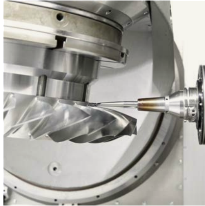
Side and radial access