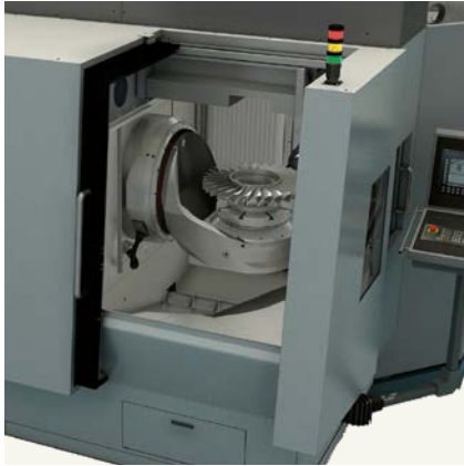
Ergonomic part loading