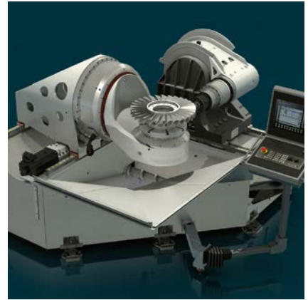
Kinematics for highest performance